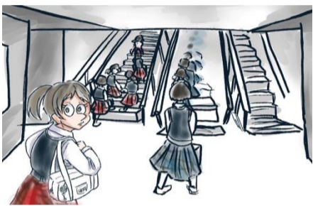
All drawings by

With Shoei's long history there is no denying some intriguing unspoken rules among students. We would like to introduce the most interesting agreement: The Escalator Caste System.