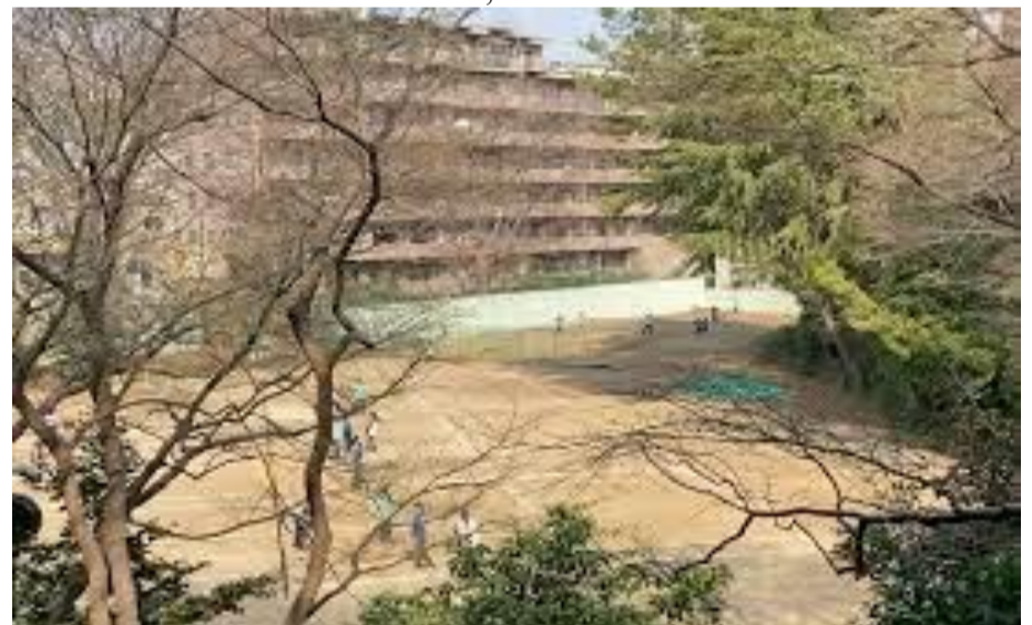
Shoei's forest

When you go a little deeper into Shoei, you are met with a tiny forest. It is full of nature; however the students cannot step one foot into the forest. The fallen leaves and potentially dangerous creatures make it a place which students are forbidden to enter. However,