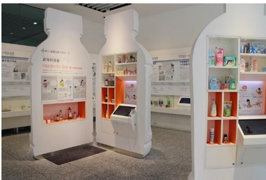
A picture of Museum of Package Culture

Have you ever experienced difficulty deciding where to hang out with friends? Unlike public schools where most students live in close areas, students in private schools like Shoei come from many different areas. Therefore, it is difficult to pick the perfect place