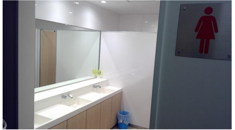
The bathroom on the bottom floor of the white house

On the contrary, the worst bathroom by far is the one on the lowest floor of Greenhill House. It had over half of the votes, which seems reasonable with its yellowish interior and musty atmosphere. To say the least, there