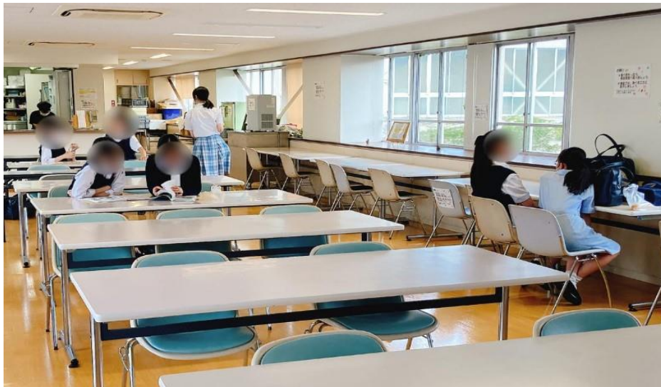
Shoei's school cafeteria

Do you know that in Shoei, there exists a room at the very top of the building that is loved by the students? Yes, you got it right. It's the school cafeteria! In this article, we will be introducing you to this place, followed by exclusive interviews from the workers. The cafeteria