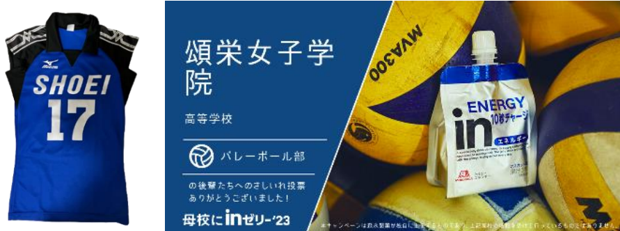
Blue uniform and Morinaga webpage by _____