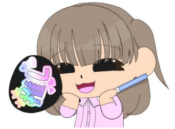
Some examples for goods to cheer on biases.