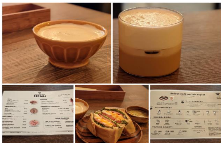
Café au lait Tokyo