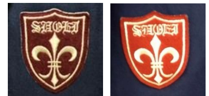
The former blazer crest (left) and the new one (right)