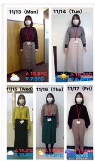
Teachers in Shoei

What do our fashionable Shoei teachers coordinate in a week?